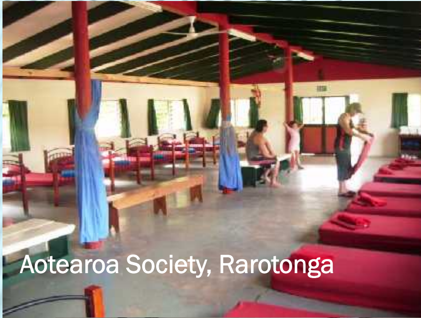
Aotearoa Society, Rarotonga