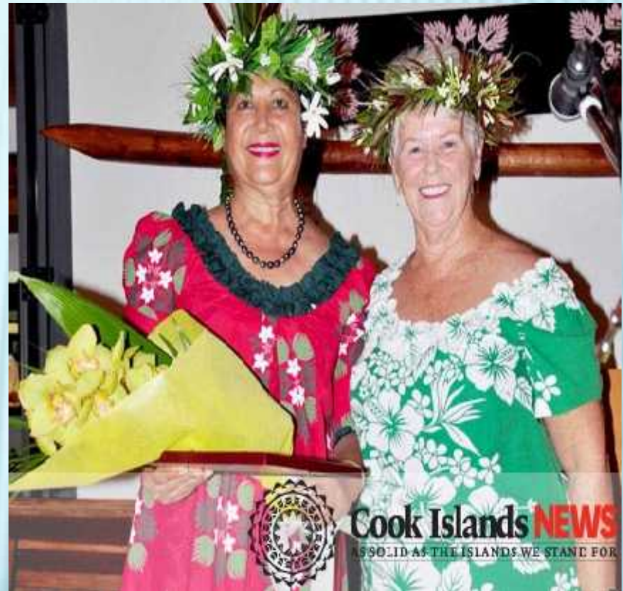
COOK ISLANDS BUSINESS AND PROFESSIONAL WOMENS ASSOCIATION