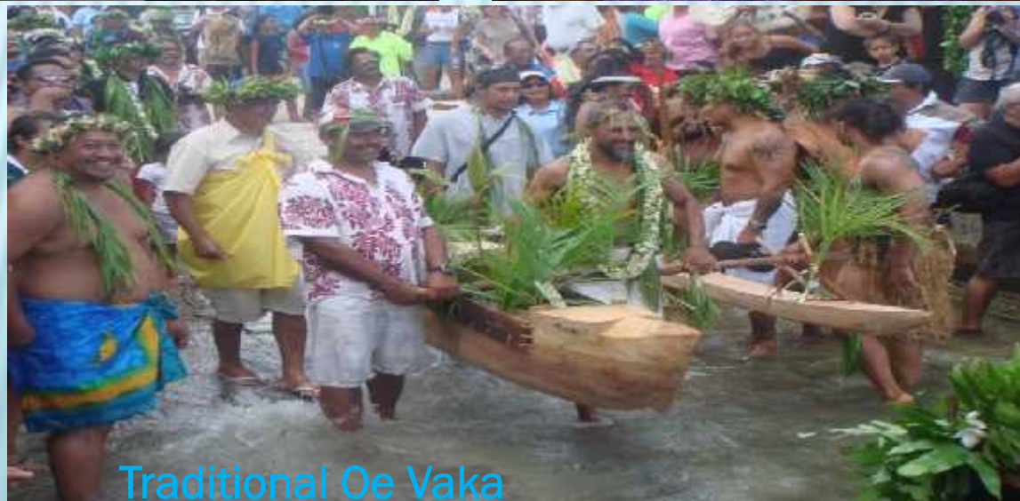
Traditional Oe Vaka