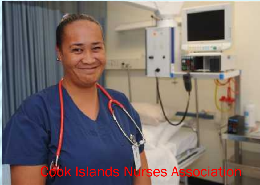
Cook Islands Nurses Association