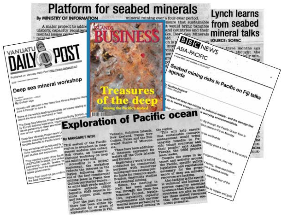
Figure 7. Samples of DSM Project press releases within and outside the region.

Following that, a local consultant (Pacific Reach Limited) was contracted in May to be responsible for all media works (prepare and disseminate press releases, TV and radio interviews, media liaison) prior to, during, and soon after the project inception workshop. Two news articles were published leading up to the workshop that led to expression of interest from various stakeholders in attending the workshop. The workshop events were pretty well covered in the press releases as shown by the media coverage during and after the workshop. Some of the press releases are shown in Figure 7 below.