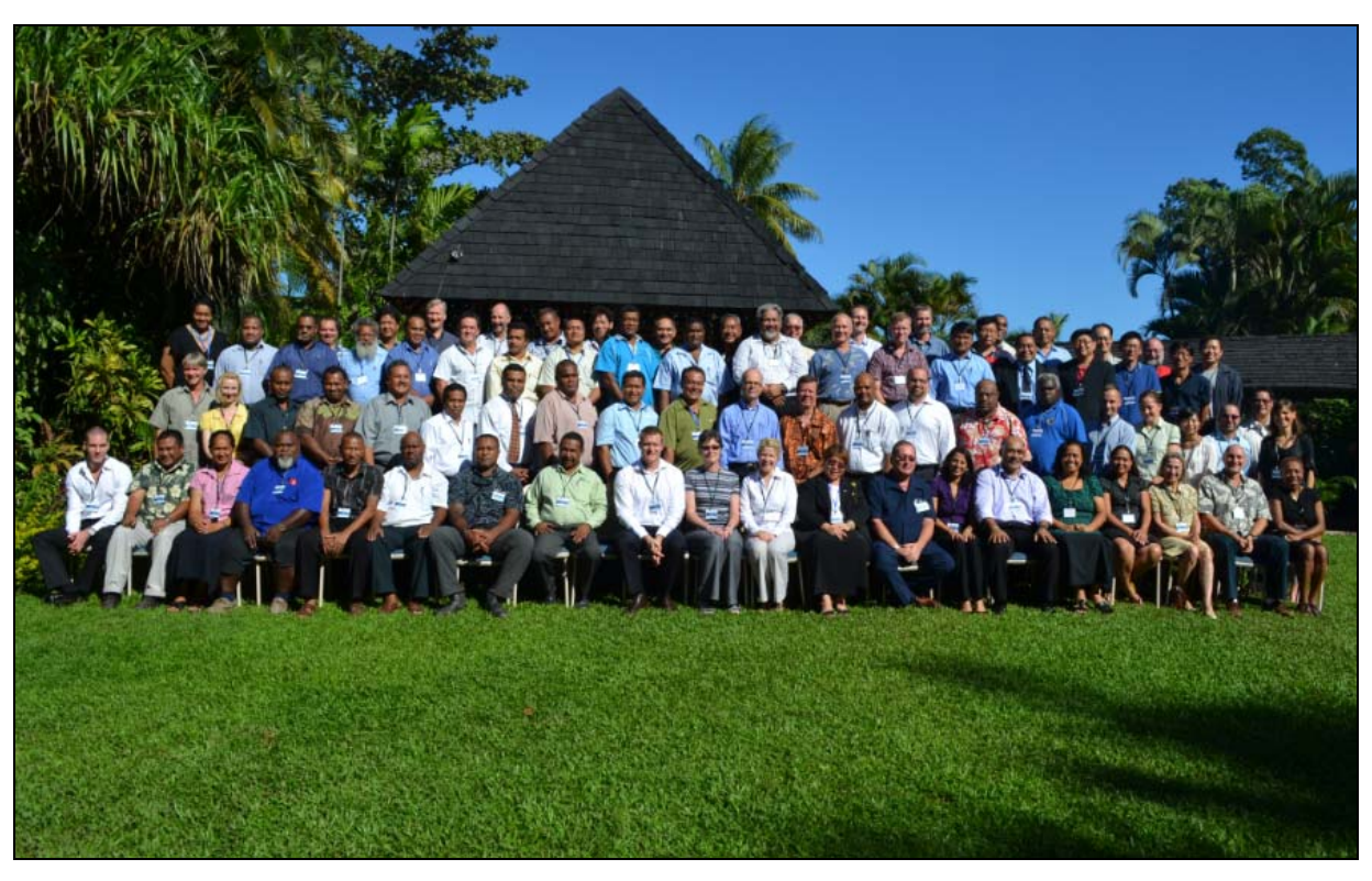
Participants of the Inaugural DSM Project Regional Workshop, Nadi Fiji, 6 – 8 June 2011.