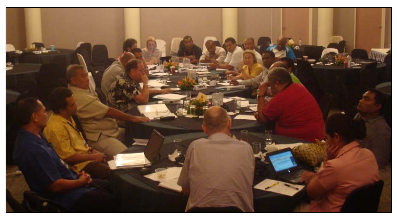
Figure 4. DSM Project Steering Committee during session in Nadi.