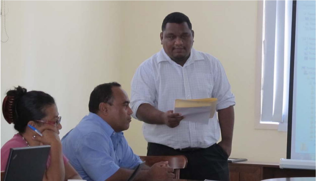
The Honorable Minister Dominic Tabuna delivering the opening address at the workshop.