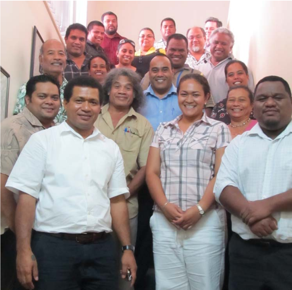
Far Right: Hon. Minister Dominic Tabuna with Nauru workshop participants.